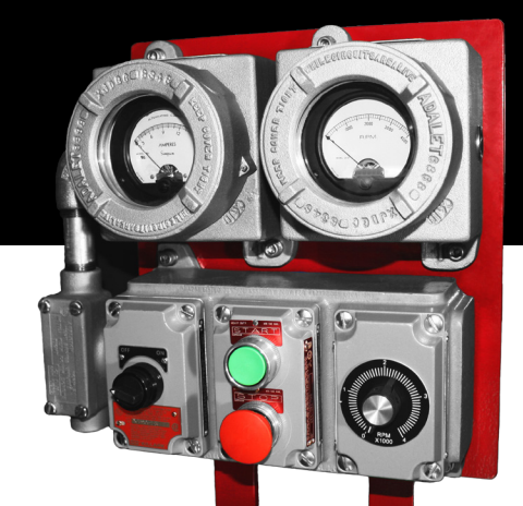
Right: M250 with PLC Controls Left: Explosion-Proof Controls

FEATURES & CAPABILITIES Mini Mills feature a built-in, two-stage internal pumping mechanism and offer variable speed operation. With options for general-purpose, explosion-proof, or intrinsically safe electrical controls, they ensure safe operation in any environment. Designed with a water-jacketed chamber and optional end plate cooling, temperature control is seamless. Quick-release latches enable easy removal of components and cleaning is achieved by simply passing a compatible solvent through the milling system.