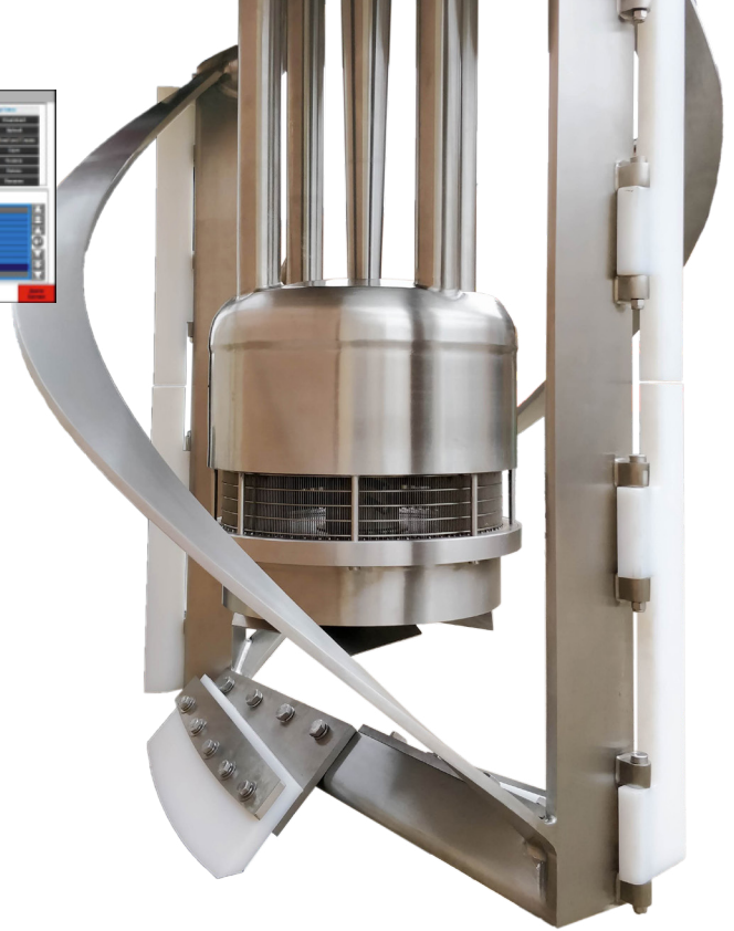
Shown Above Right - Schold VIM with Lifting Helical Arms and Scrapers

EASE OF USE | Milling is an extremely vigorous process, and milling equipment will need to be properly maintained. When a part's lifetime is up, the modular design of the Schold VIM allows for easy replacement, which means less downtime. Schold also offers a full controls package with recipes and automation.