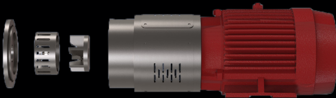
Shown Above: Exploded ILD DIMINISHEAR