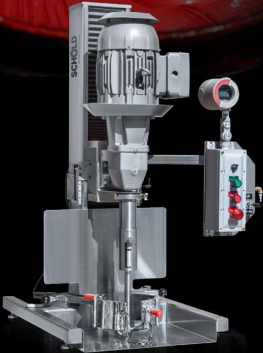
Shown Above: Explosion-Proof Model LMX